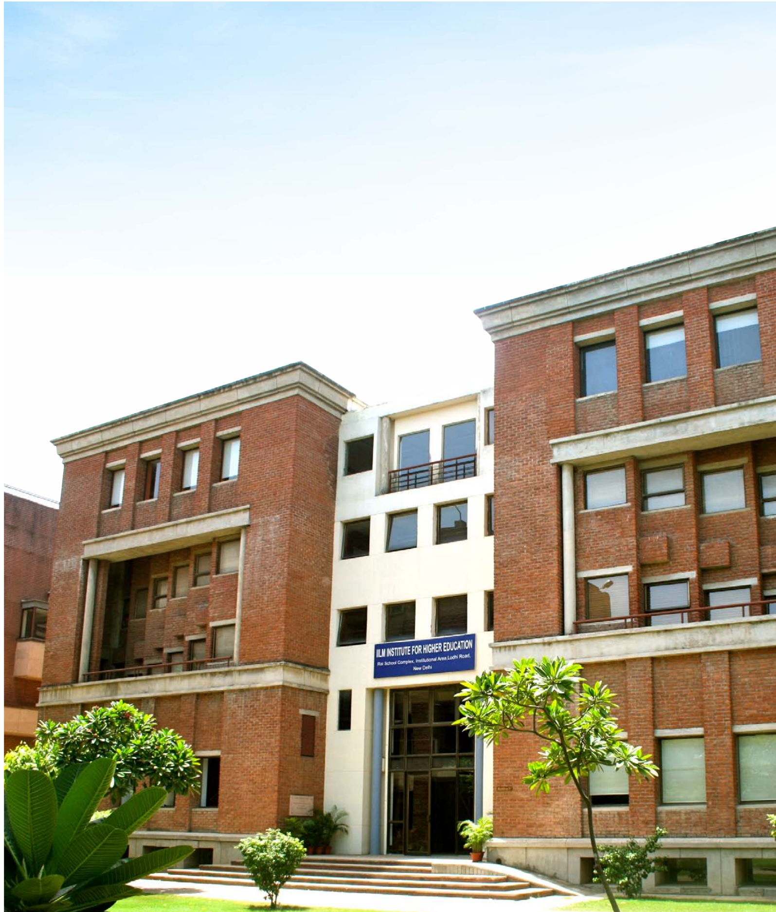
IILM Institute for Higher Education Rai School Complex, 3 Institutional Area, Lodhi Road, New Delhi – 110003